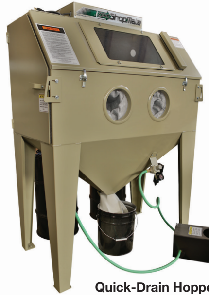
Quick-Drain Hopper 5-gallon bucket not included

ZERO® cabinets feature the BNP® gun, a ZERO® design that sets the standard for performance, versatility, and durability. Its performance-driven design and precise manufacturing give it unparalleled air-to-media efficiency. The ZERO® BNP® gun delivers unbeatable performance not seen in other cabinets in this price range.